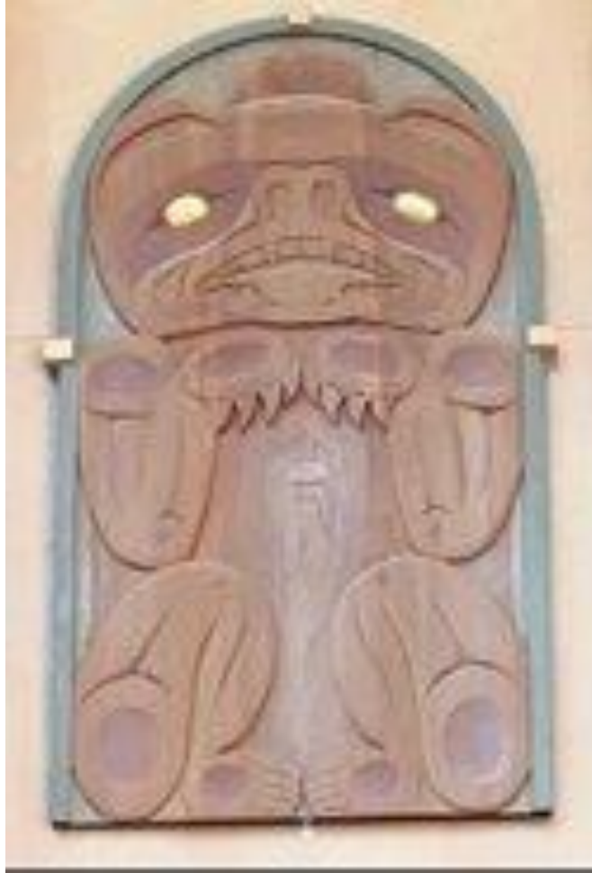
Something symbolic of the Kodiaks