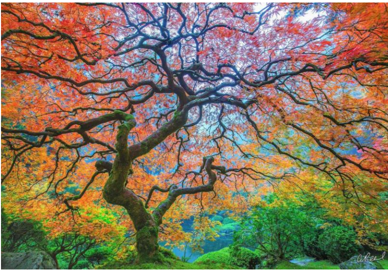
Something wonderful and beautiful in nature.